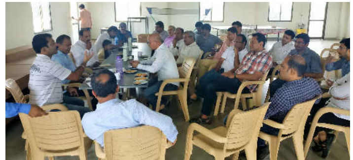
Alumni Meet held on 26-08-2018 at Bengaluru.