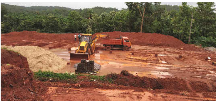
Current status at Balakuteera campus, Alike.