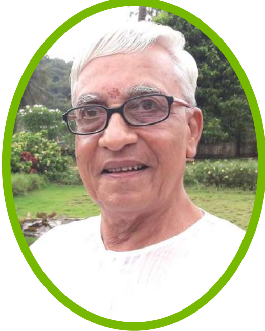
ಜನನ : 07-09-1946 ಮರಣ : 04-06-2020