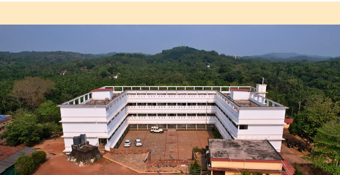
Sri Sathya Sai Loka Seva High School, Balakuteera