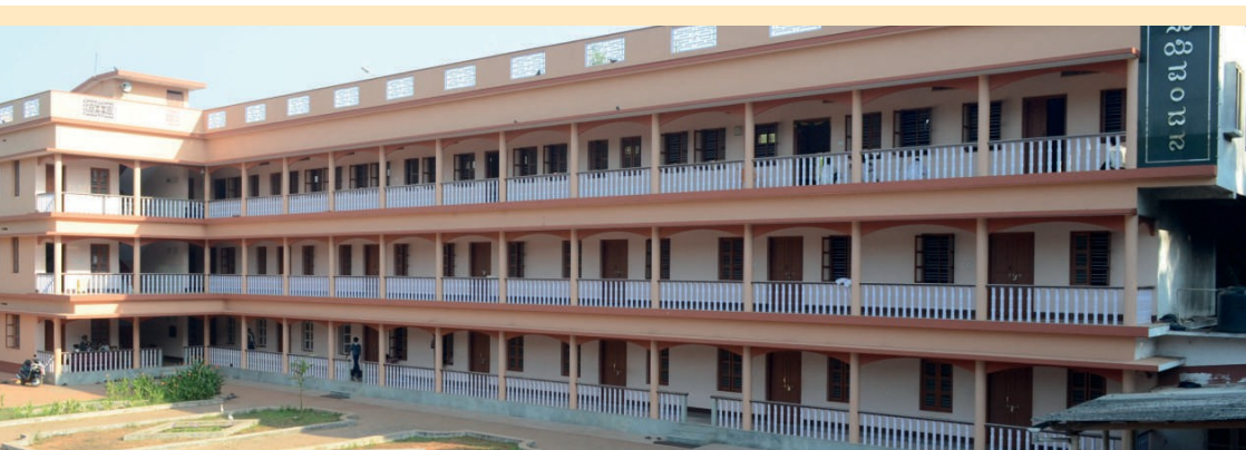
Boys Hostel (Balakuteera - State Syllabus)