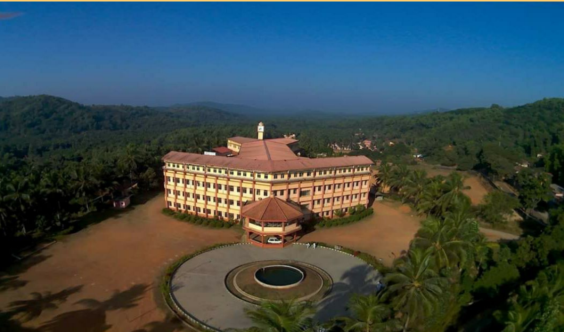
Sri Sathya Sai Loka Seva Vidya Kendra, Alike (CBSE)

Students will not be allowed readmission to the same class, even if their parents are willing.