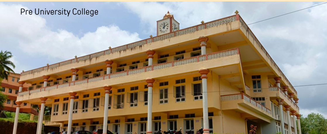
Pre University College