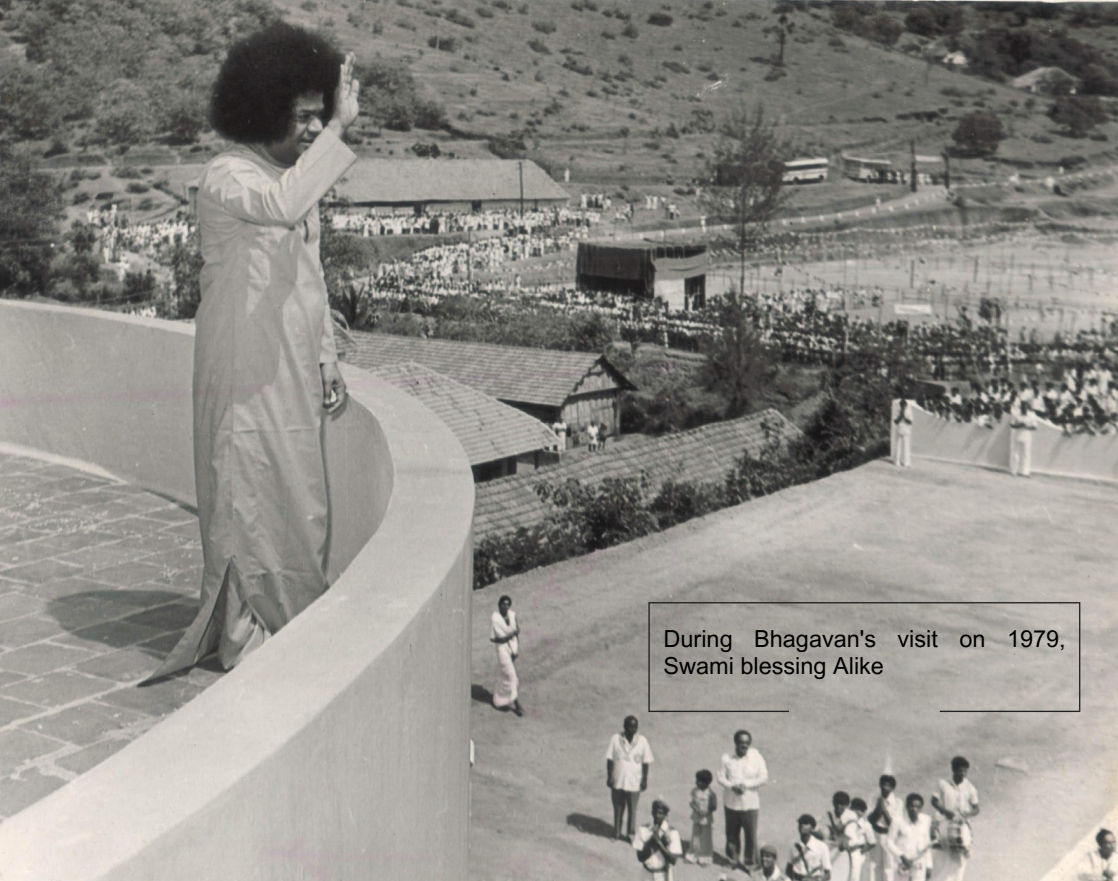
During Bhagavan's visit on 1979, Swami blessing Alike