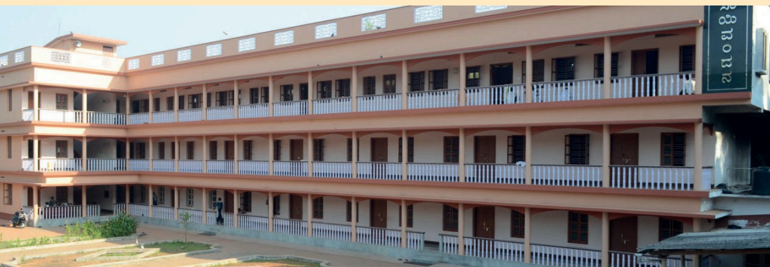
Boys Hostel (Balakuteera - State Syllabus)