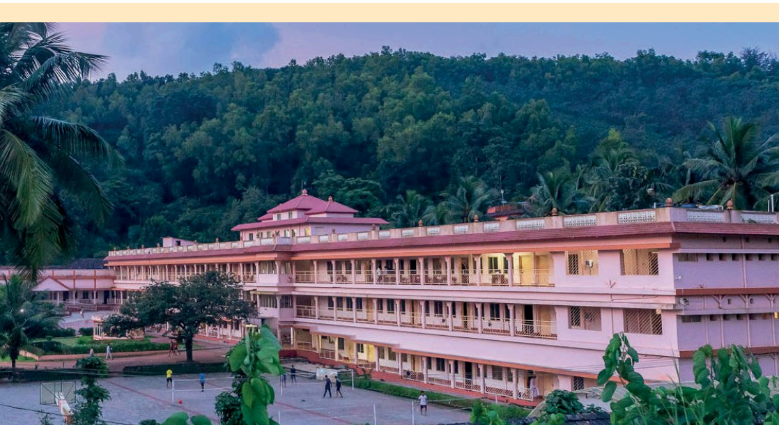
Boys Hostel (PU College)

Influence or pressure of any kind, through any authorities, will lead to negative marks to aspiring students.