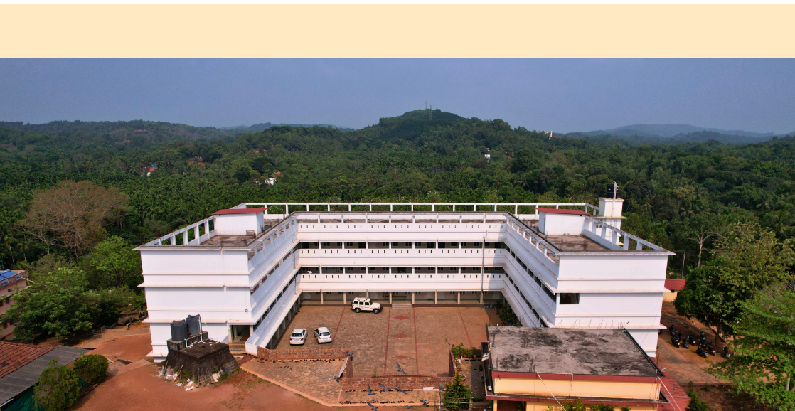
Sri Sathya Sai Loka Seva High School, Balakuteera