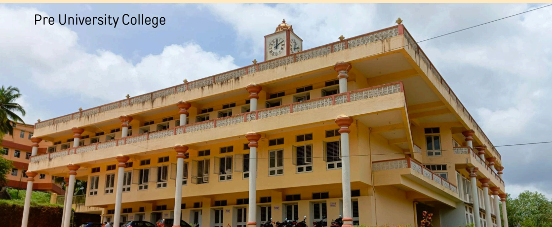
Pre University College